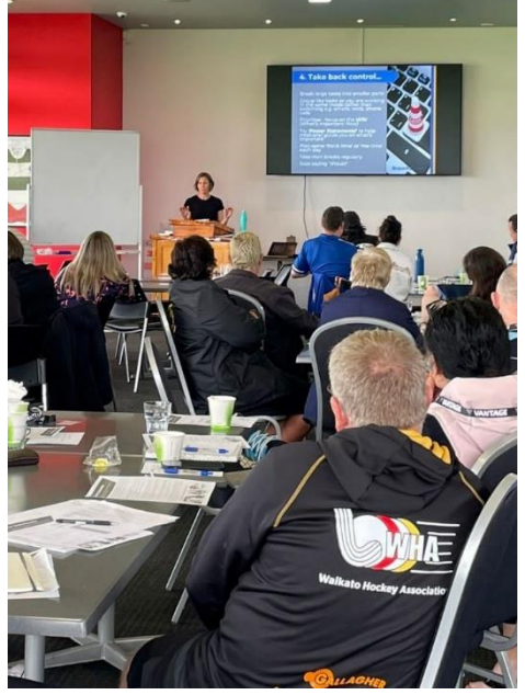
Hockey NZ 'Brainfit At Work' Workshop

As we all know, in today's fast-paced and competitive world, having a sharp and focused brain is crucial. The Brainfit® At Work programme is specifically crafted to address the challenges your employees may face, allowing them to maintain peak cognitive function across their busy working day. Brain overload has become a health and safety issue which undermines individuals mental & physical wellbeing, creates stress, saps confidence, reduces performance increases levels of absenteeism and can lead to staff churn.